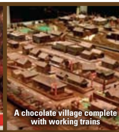
A chocolate village complete with working trains