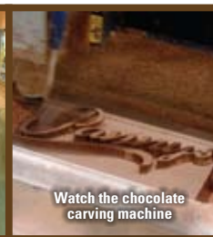
Watch the chocolate carving machine