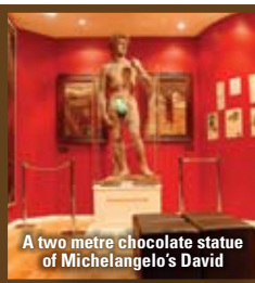
A two metre chocolate statue of Michelangelo's David