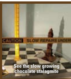
CAUTION SLOW REPAIRS UNDERWAY