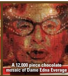
A 12,000 piece chocolate mosaic of Dame Edna Everage