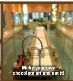
Make your own chocolate art and eat it!