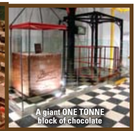
A giant ONE TONNE block of chocolate