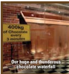
400kg of Chocolate every 3 minutes