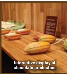
Interactive display of chocolate production