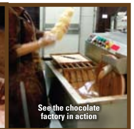
See the chocolate factory in action