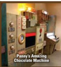
Panny's Amazing Chocolate Machine